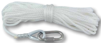
Poly Rope Assembly # 360096 shown